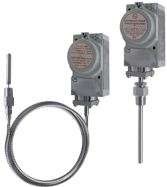
Fig. left: Temperature switch model TCS-C Fig. right: Temperature switch model TCS-B