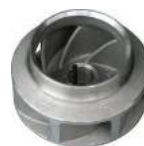
AISI-304 Stainless Steel Impeller